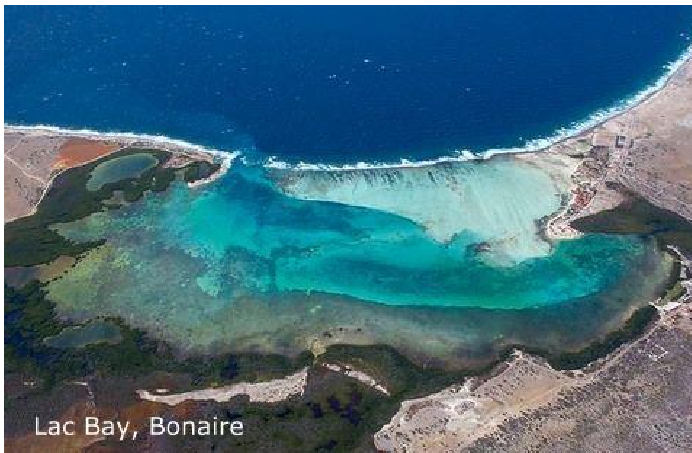
Lac Bay, Bonaire