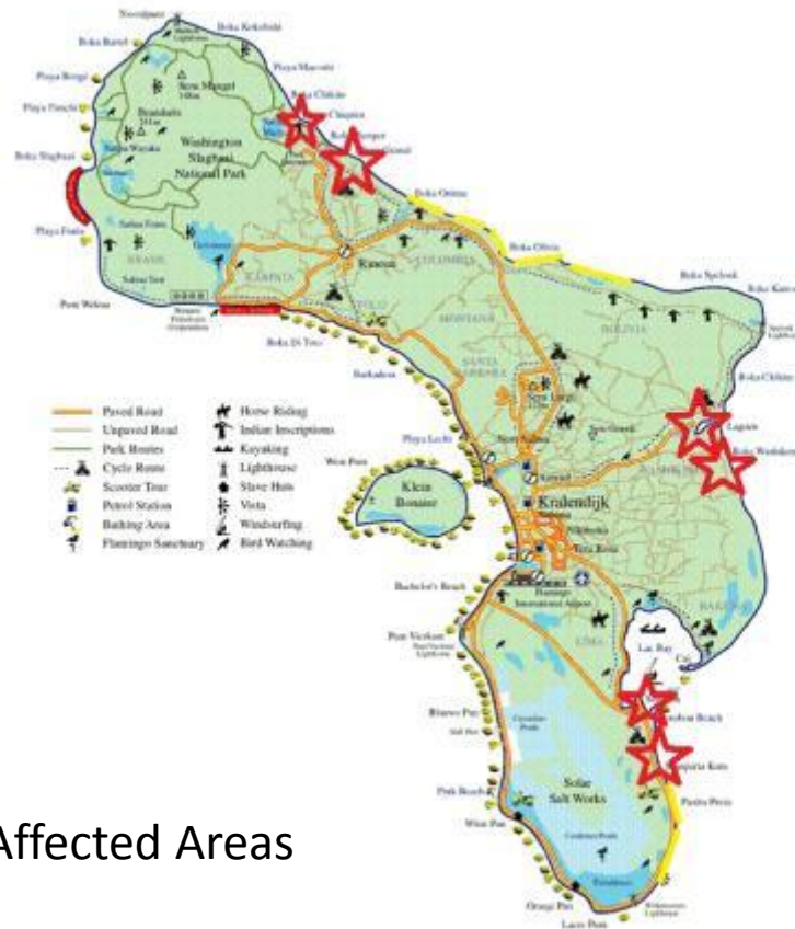
Bonaire Affected Areas